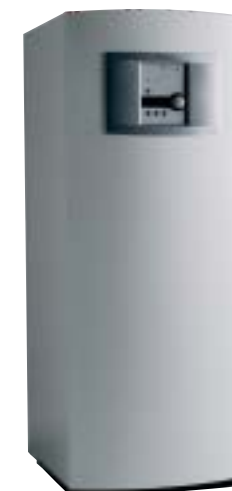
Greenskies solar water heating and Greenstore ground source heat pump