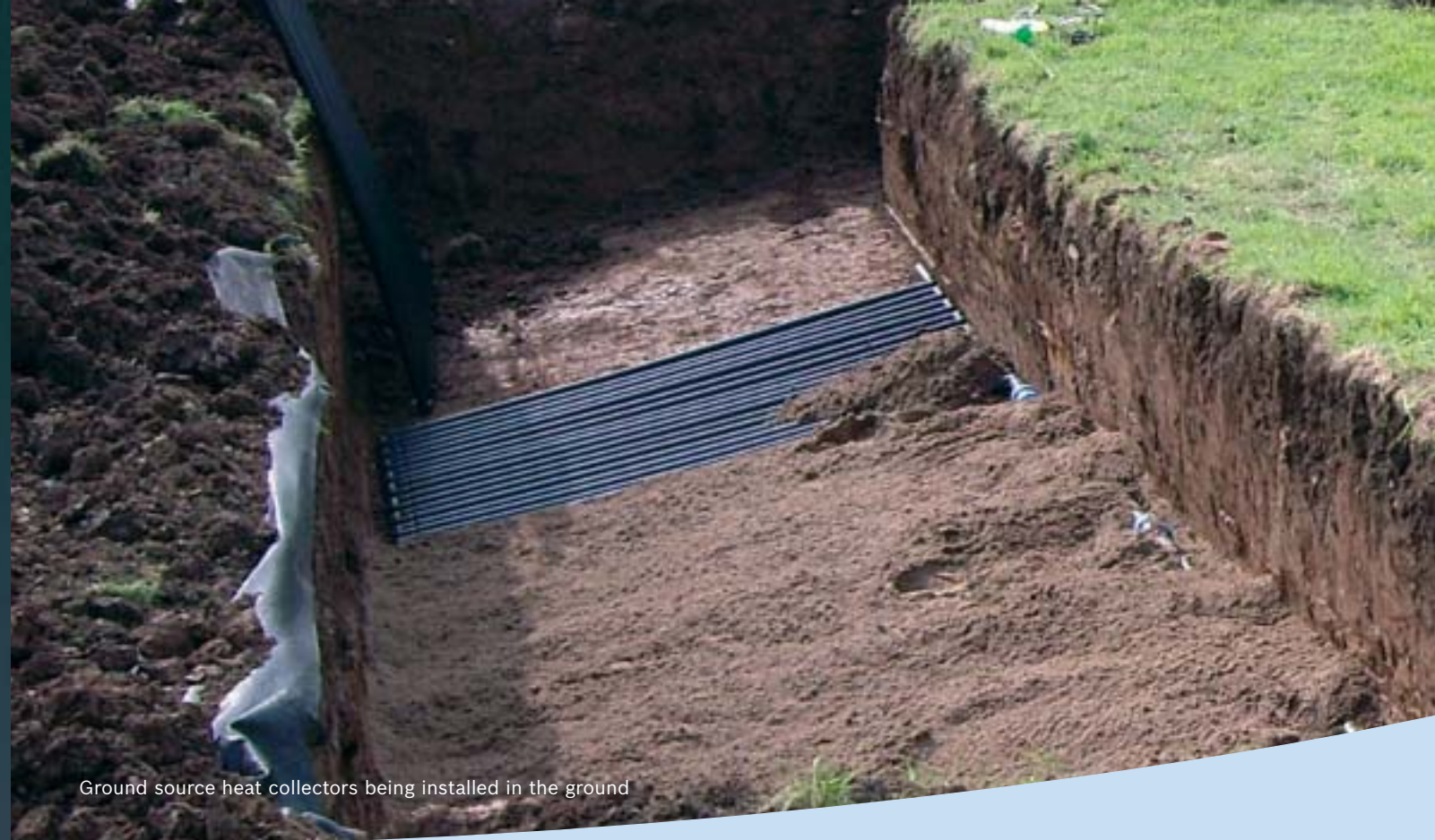
Ground source heat collectors being installed in the ground