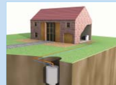
Bore hole collector